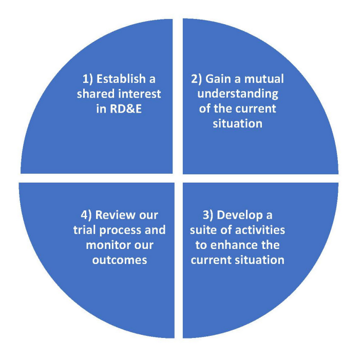
Figure 3: the process of engagement of the private sector in action research trials:

implemented as part of the trial and beyond the project's duration. This action-oriented approach in the implementation phases followed a classic action research cycle of 'plan, do, observe, review'.