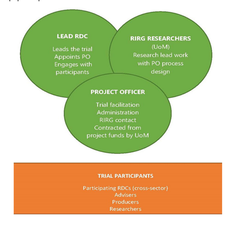
Figure 2: Trial set up: participants and roles