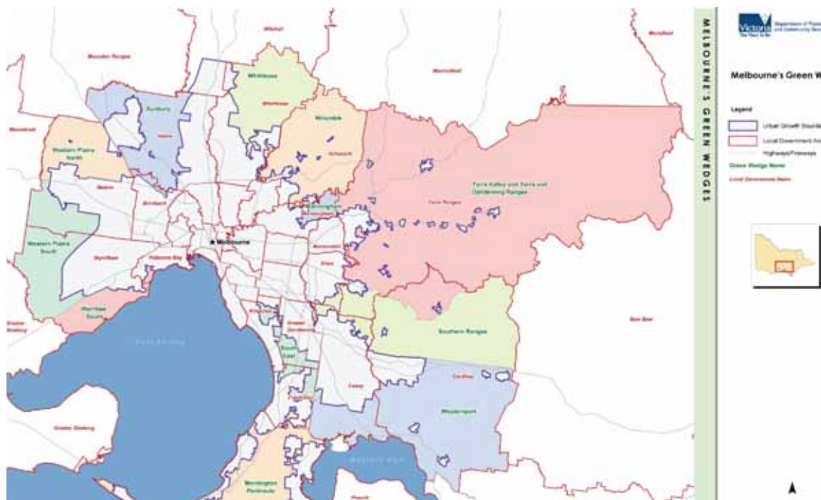
Figure 2. Melbourne’s Green Wedges.